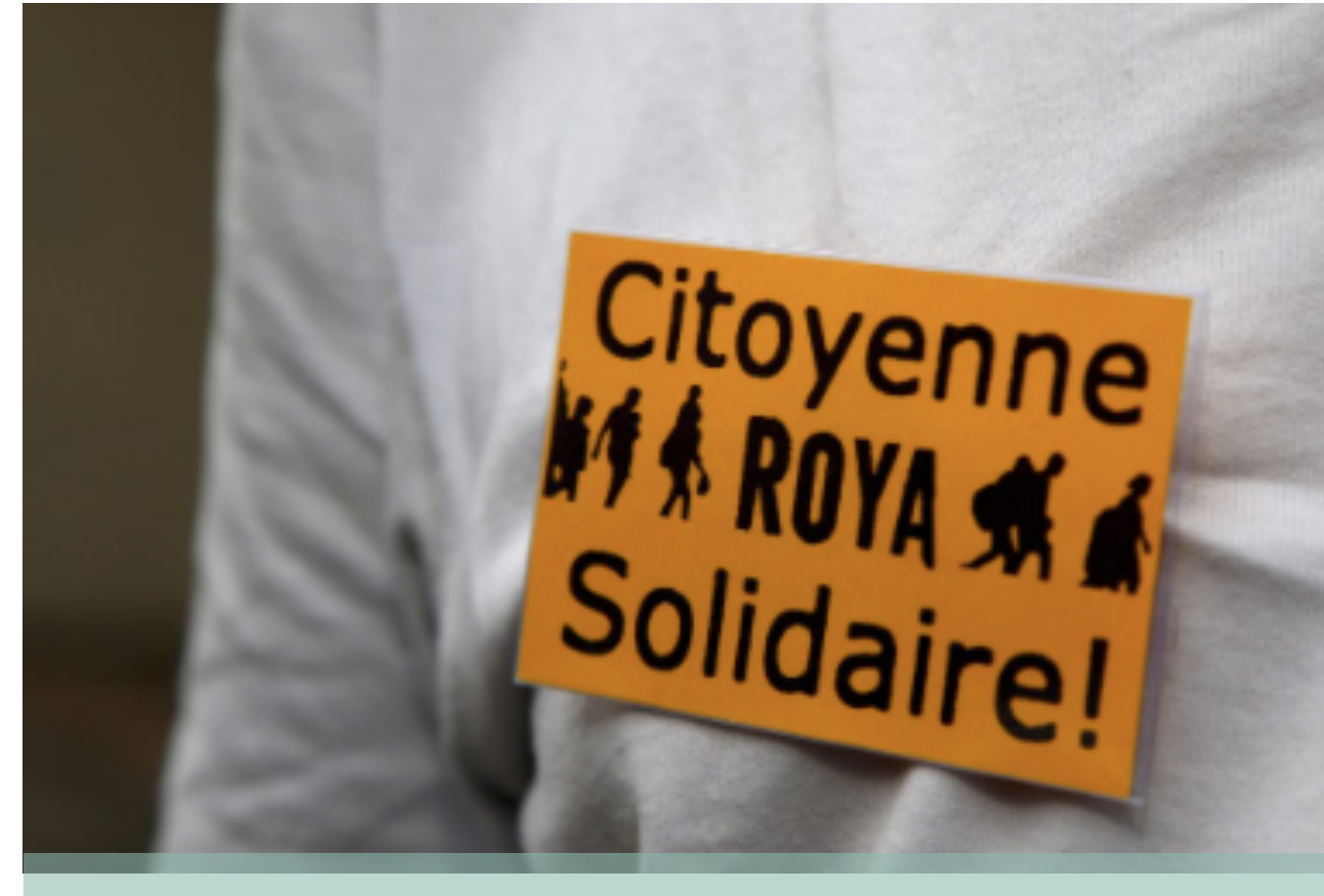
The love of one's country is a splendid thing. But why should love stop at the border? Pablo Casals, musician

#noborderagain #humanright #fearlesscities #migration #helpers #thevalley #noborders #free #equality #brotherhood #dignity #helpers #conscienceness #forAlps #change #move #revolve #bonds #history #migration #laroya #awareness #nonfiction #breackinglaws #defenders #goodpitch #nomoreborders #equality #HelpIsNoCrime #WelcomingEurope #LetUsHelp #opendemocracie